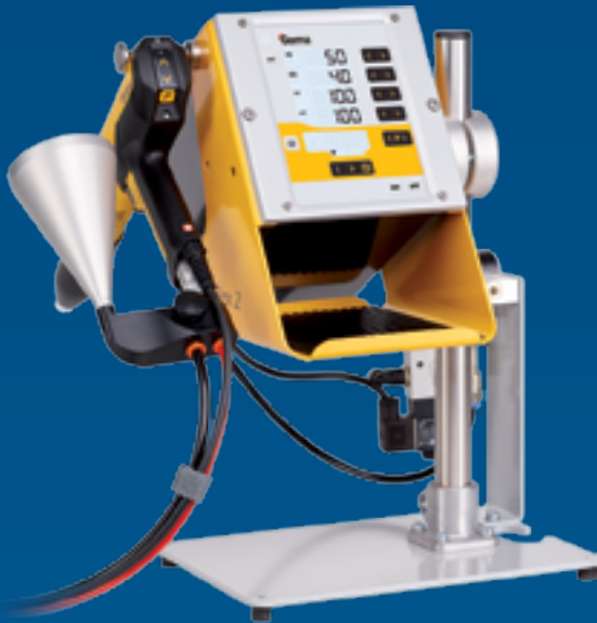
OptiFlex® 2 CF