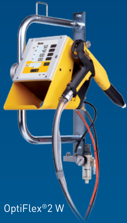
OptiFlex® 2 W