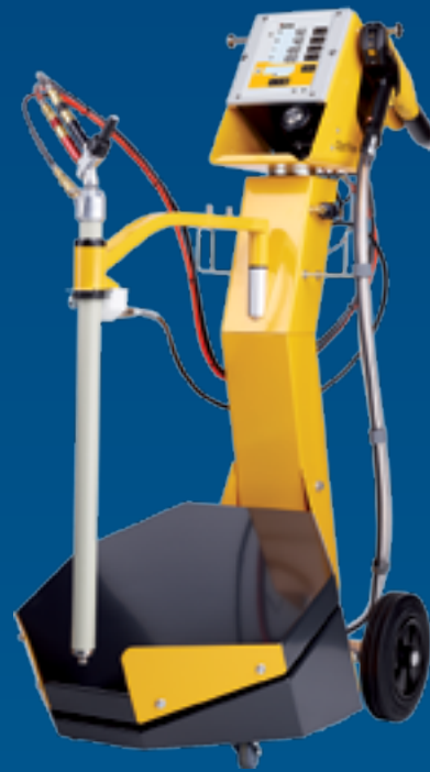
OptiFlex® 2 Q