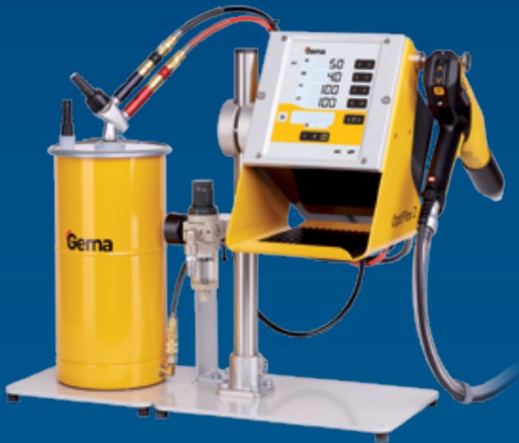
OptiFlex® 2 L