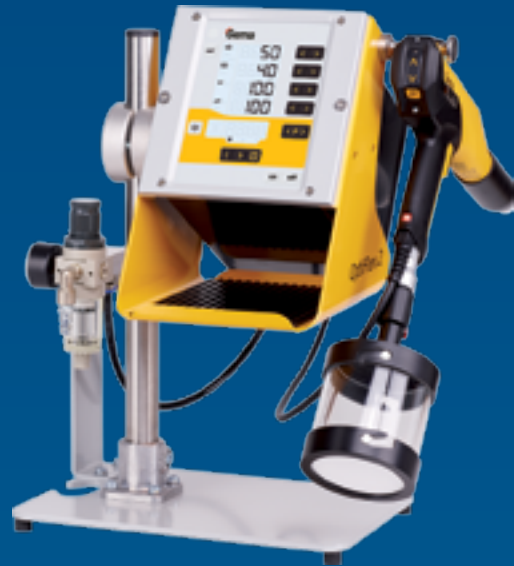
OptiFlex® 2 C