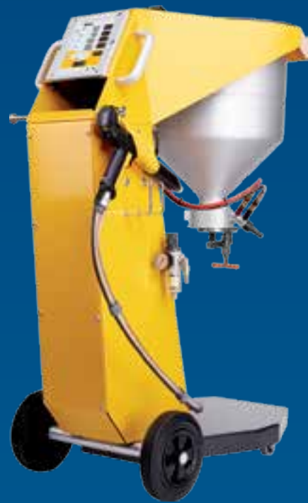
OptiFlex® 2 S