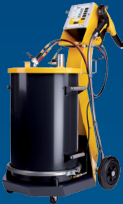
OptiFlex® 2 F