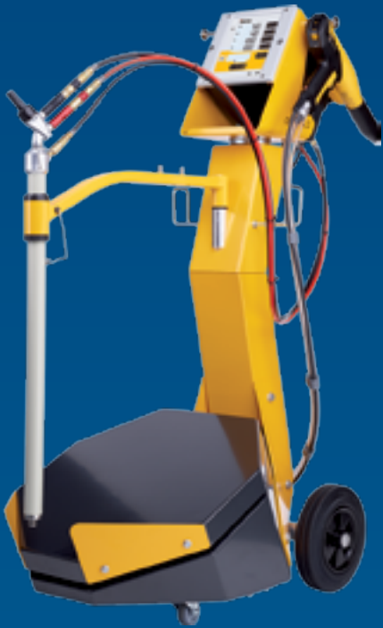
OptiFlex® 2 B