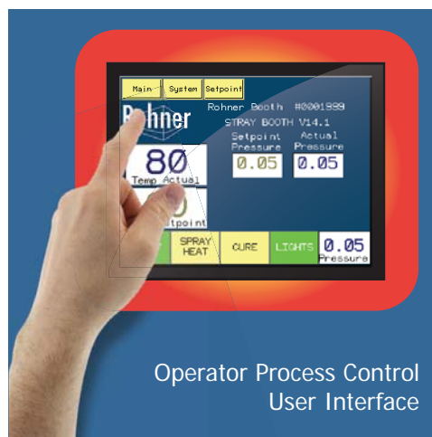
Operator Process Control User Interface

Perfect for managers and service technicians - use the optional wireless feature to remotely monitor and control your process. Application runs on all Android & IOS devices.