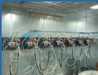
Optional integrated pump mounting support

Ventilation rates are sized at a minimum of 8 times the NFPA requirement to further reduce the operator's exposure.