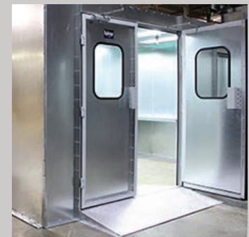
Optional barrel ramp and double doors