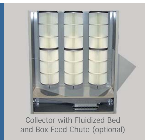
Collector with Fluidized Bed and Box Feed Chute (optional)