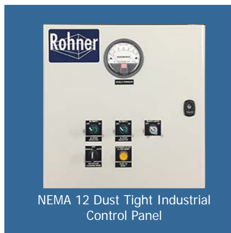
NEMA 12 Dust Tight Industrial Control Panel

High quality aluminum 12 blade airfoil wheels provide maximum efficiency and low sound. Blowers are powered by a premium efficiency TEFC 3-phase motor.