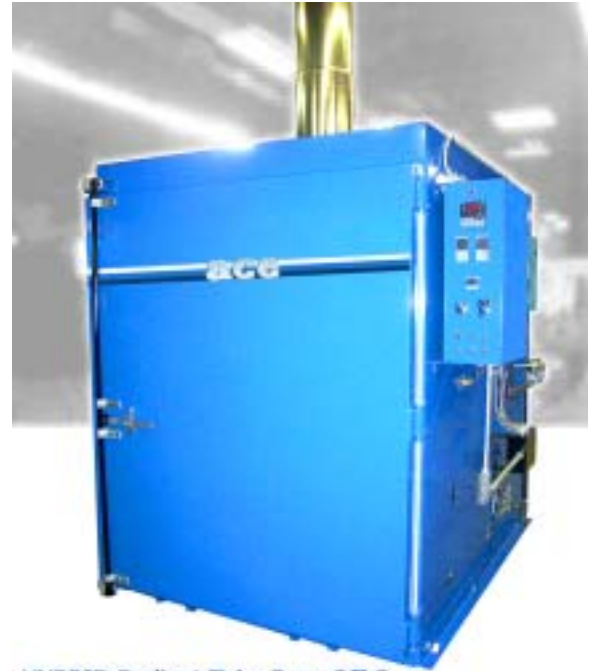
HYBRID Radiant Tube Burn Off Oven